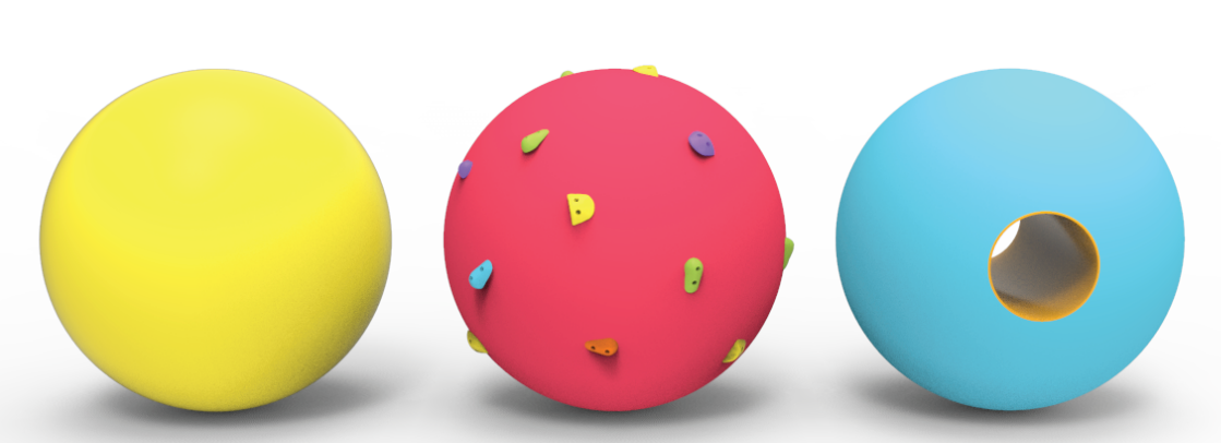
Optionally with climbing holds and PVC tube or stainless steel tube with diameter Ø500mm.